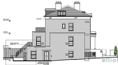
PROPOSED SIDE ELEVATION site 1:100 @ A1