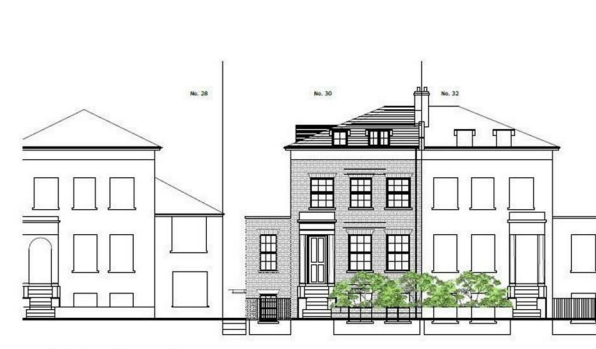
PROPOSED FRONT ELEVATION Scale 1:100 @ A1