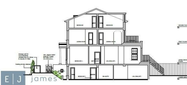
PROPOSED SECTION A-A Scale 1:100 @ A1